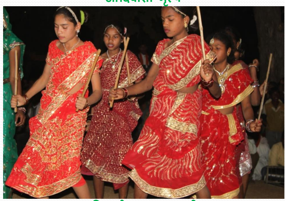
आदिवासी नृत्य - गदली