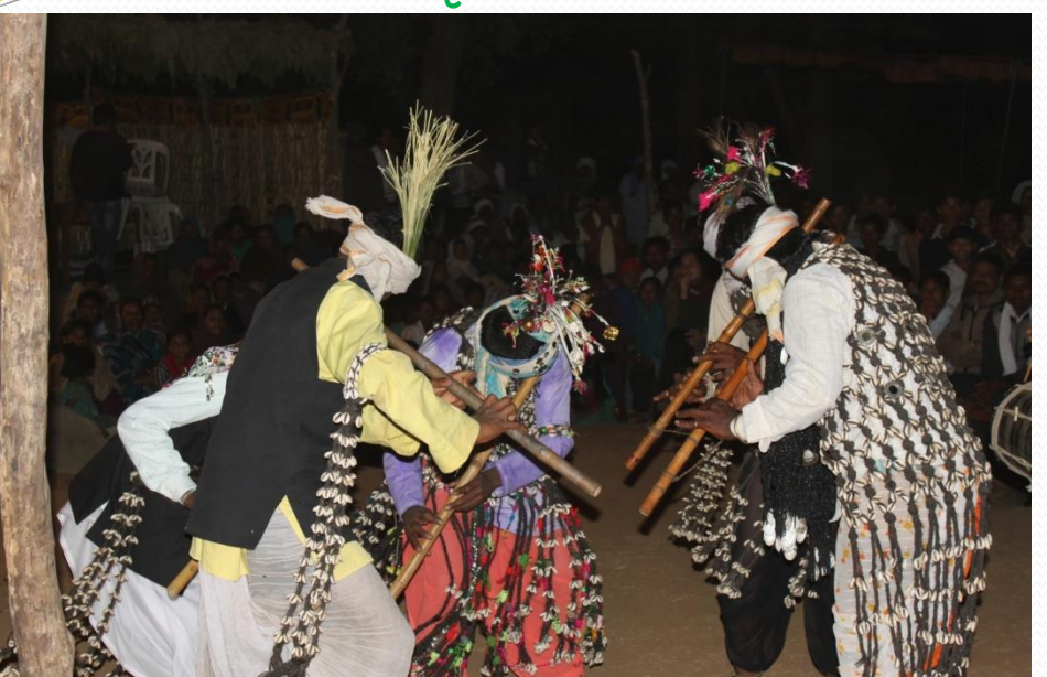
ग्रामीणों द्वारा नुक्कड़ नाटक