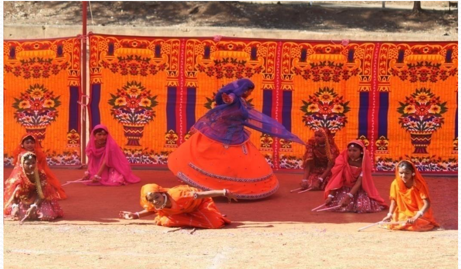
राष्ट्रीयता की भावना